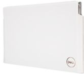
Dell Premier Sleeve - XPS 13 (white)